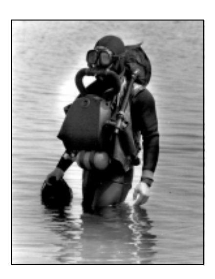
Figure 18-1. Diver in Draeger LAR V UBA.

The term closed-circuit oxygen rebreather describes a specialized type of underwater breathing apparatus (UBA). In this type of UBA, all exhaled gas is kept within the rig. As it is exhaled, the gas is carried via the exhalation hose to an absorbent canister through a carbon dioxide-absorbent bed that removes the carbon dioxide by chemically reacting with the carbon dioxide produced as the diver breathes. After the unused oxygen passes through the canister, the gas travels to the breathing bag where it is available to be inhaled again by the diver. The gas supply used in such a rig is pure oxygen, which prevents inert gas buildup in the diver and allows all of the gas carried by the diver to be used for metabolic needs. Closed-circuit oxygen UBAs offer advantages valuable to special warfare, including stealth (no escaping bubbles), extended operating duration, and less weight than open-circuit air scuba. Weighed against these advantages are the disadvantages of increased hazards to the